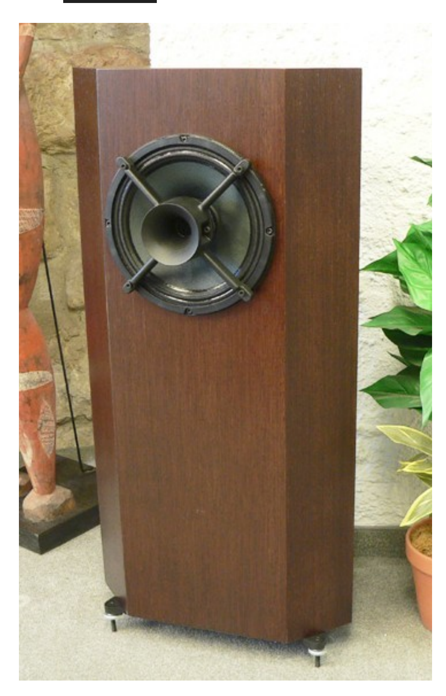
"Bringing back life to music »

B.A.C.H. 10 = Bass Adjustable Coaxial Horn with 10" driver